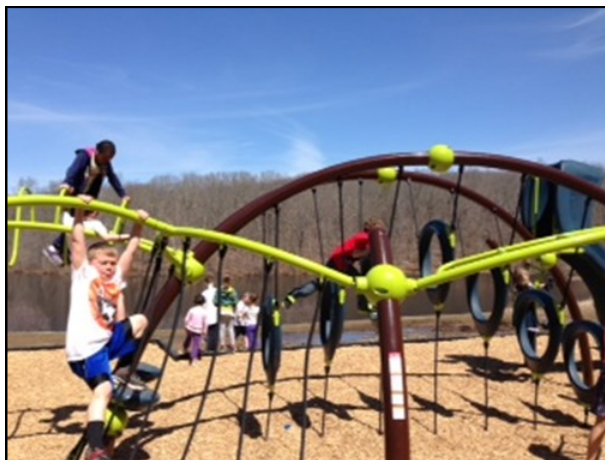
Turn the page for more Summertime fun...

Looking to try something new? Try Paddleboarding!