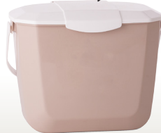
Kitchen Scrap Pail $5.00

Adjusted price with Town of Mansfield $7 subsidy